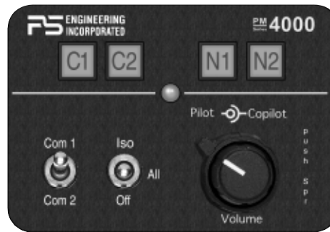
Shown actual size

An optional internal digital recorder (p/n 11941) can provide up to one minute of stored aircraft radio reception. This device is a continuous loop recorder that automatically starts recording the instant a radio transmission is received, with no dead air time recorded. By pressing a momentary switch, the last recorded messages will be replayed. Up to 16 messages (or 1 minute) can be stored.