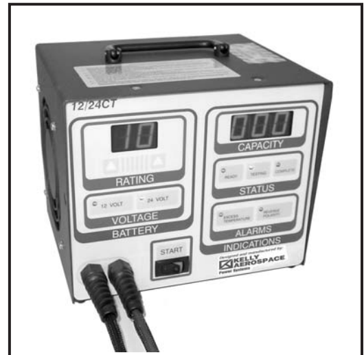
Figure 1 – BC3000-0001 Battery Capacity Analyzer