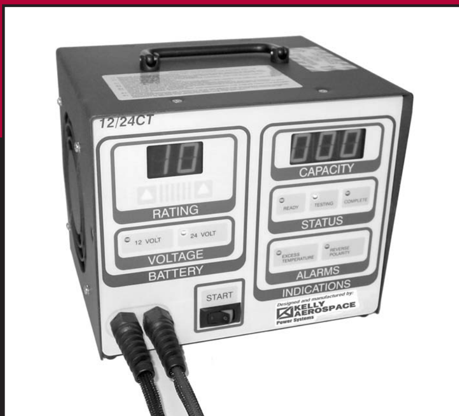
Battery Capacity Analyzer P/N: BC3000-0001 Revision B