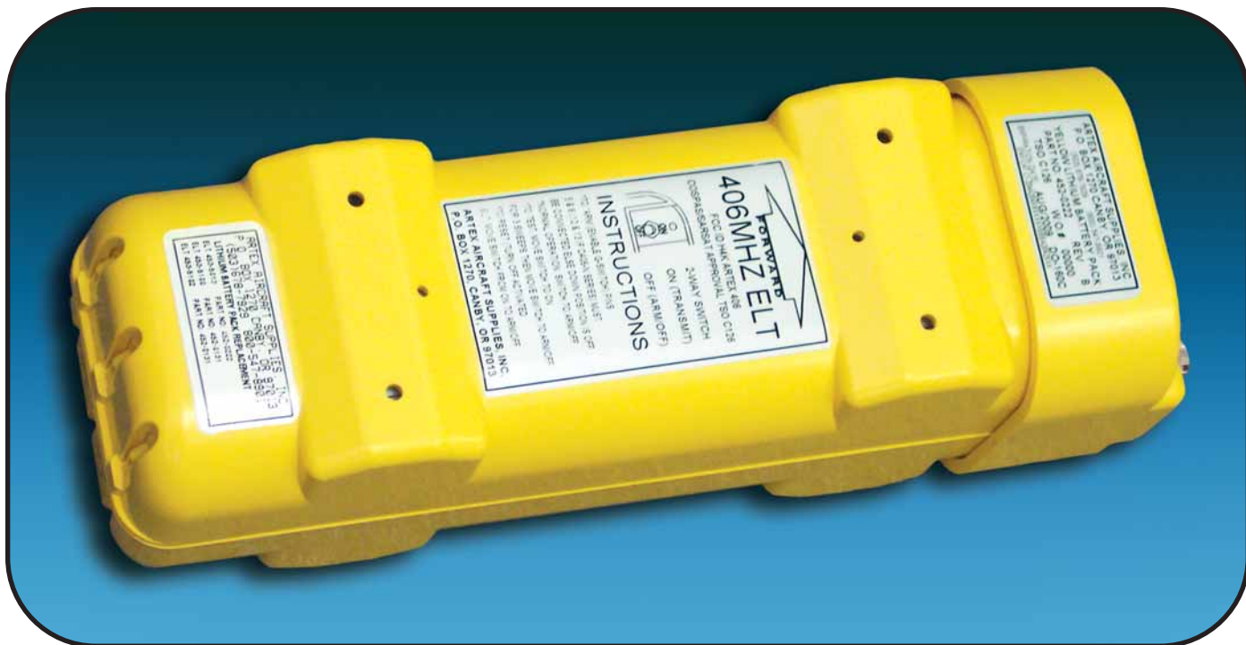
G406-4 Transmitter Installation Configuration