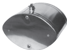
PITTS SPECIAL FUEL TANK