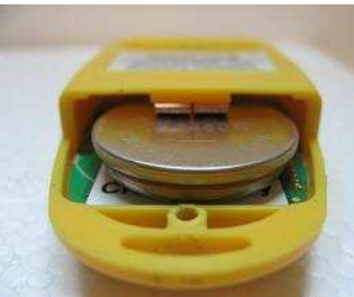
5. Push battery forward as far as it will go.