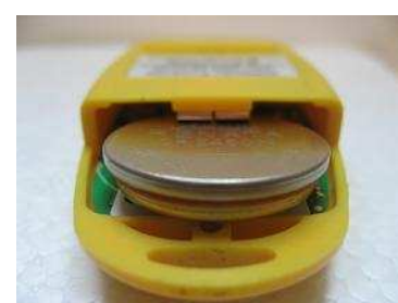
4. Insert new battery, positive (+) side facing up.

Check inside of battery cover for calibration due date.